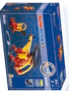
Solar Art.-Nr. 520 996