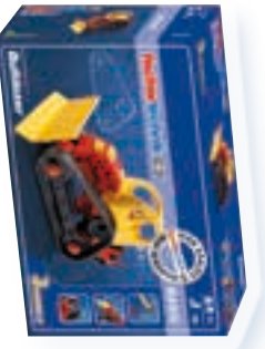
Bulldozer Art.-Nr. 520 985