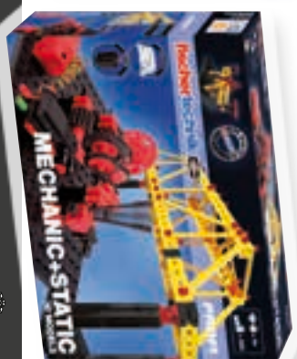
Mechanic+Static Art.-Nr. 93 291