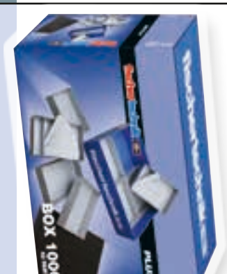
Box 1000 Art.-Nr. 30 383