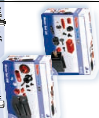
Motor Set XS Art.-Nr. 505 281