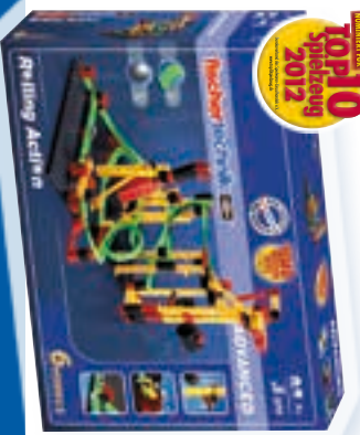
Rolling Action Art.-Nr. 516 183