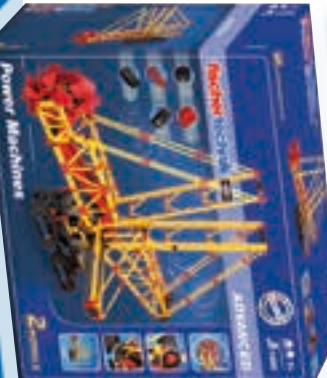
Power Machines Art.-Nr. 520 988