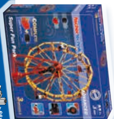
Super Fun Park Art.-Nr. 520 775