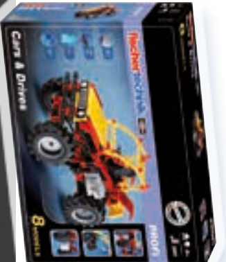
Cars & Drives Art.-Nr. 516 184