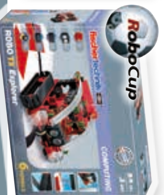
RoboCup Art.-Nr. 508 778