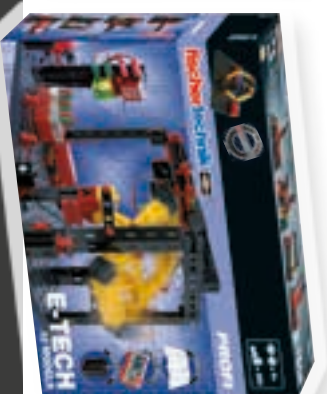
E-Tech Art.-Nr. 511 933