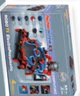
Robo TX ElectroPneumatic Art.-Nr. 516 186