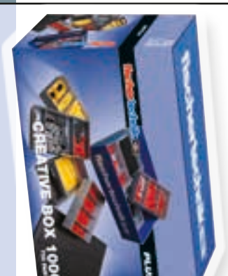
Creative Box 1000 Art.-Nr. 91 082