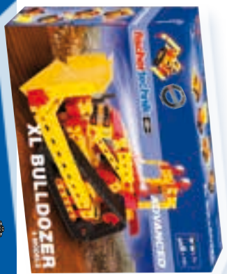
XL Bulldozer Art.-Nr. 516 280