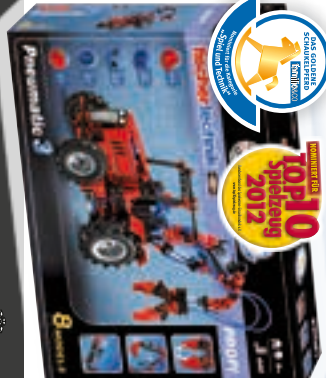
Pneumatic 3 Art.-Nr. 516 185