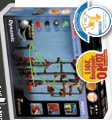
Dynamic Art.-Nr. 511 932