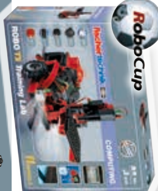
Robo TX Training Lab Art.-Nr. 505 286