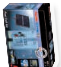
Fuel Cell Kit Art.-Nr. 520 401