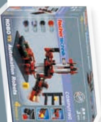
Robo TX Automation Robots Art.-Nr. 511 933