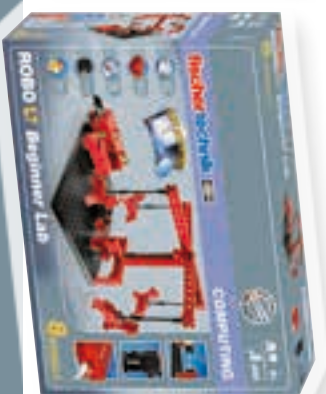
Robo LT Beginner Lab Art.-Nr. 508 777