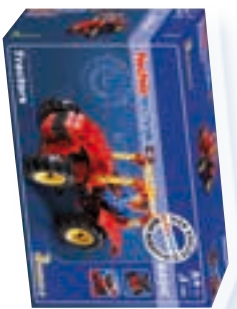
Tractors Art.-Nr. 520 397