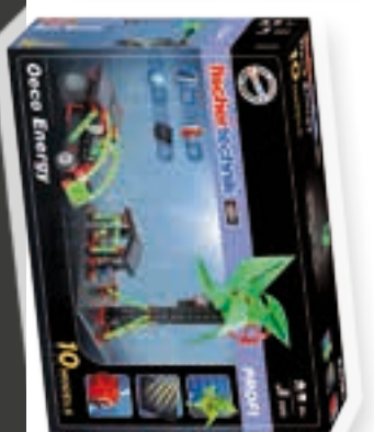
Oeco Energy Art.-Nr. 520 400