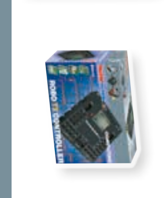
Robo TX Controller Art.-Nr. 500 995