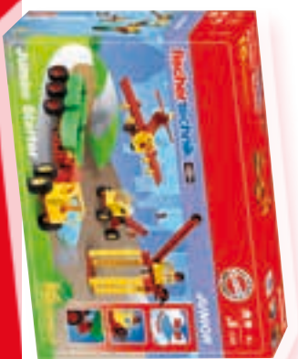
Jumbo Starter Art.-Nr. 511 930