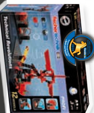
Technical Revolutions Art.-Nr. 520 776