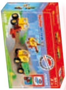
Little Starter Art.-Nr. 511 929