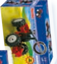
Carts Art.-Nr. 505 279