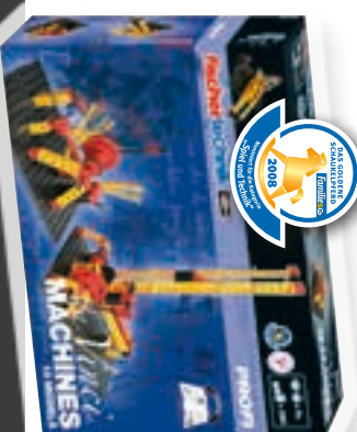
Da Vinci Machines Art.-Nr. 500 882