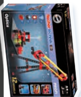
Optics Art.-Nr. 520 999