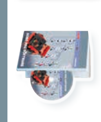
Robo Pro Software Art.-Nr. 93 296