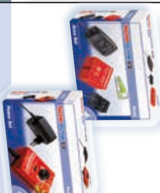
Power Set Art.-Nr. 505 283