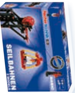
Cable Cars Art.-Nr. 41 859