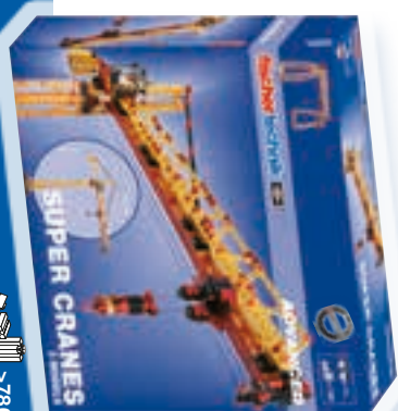
Super Cranes Art.-Nr. 41 882