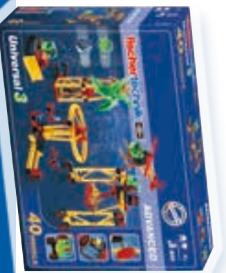
Universal 3 Art.-Nr. 511 931