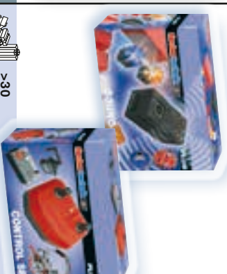
Control Set Art.-Nr. 500 880